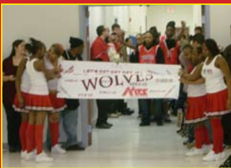
The MTS boy's basketball team makes a big entrance at the first MTS pep fest.

The students decided to plan this pep fest because they wanted to show school spirit and encourage MTS students to attend the Wolves basketball games. The pep fest recognized all of the players on the team, and let the students of MTS know how