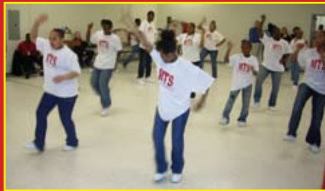
The MTS Drill & Dance Performance team performed at the pep fest.

the team improved over the season. The pep fest was humorous because the basketball players and cheerleaders had a dance-off to see who had the best "moves." Although the Wolves were able to show their "moves"