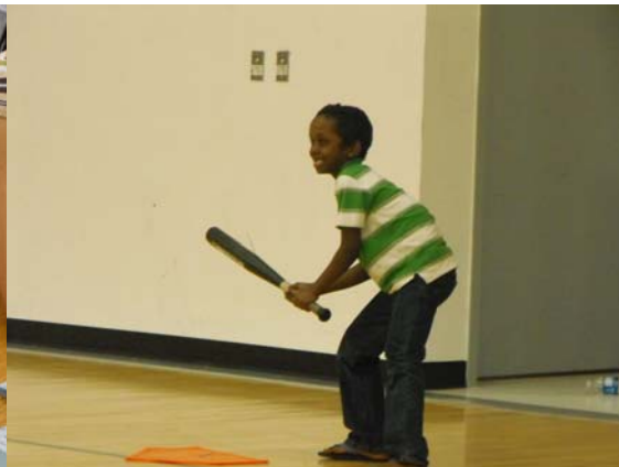
Math whiffle ball