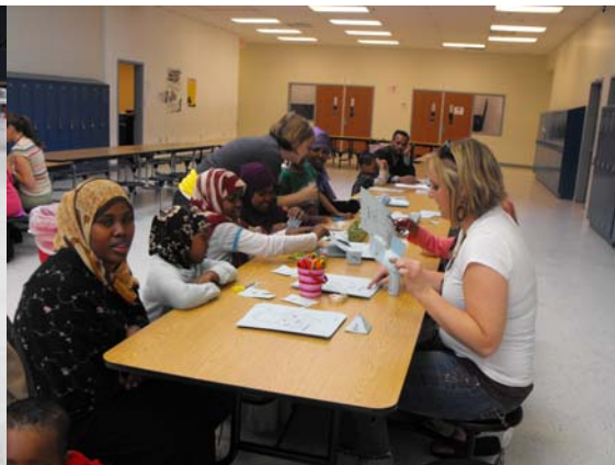
Building geometric figures